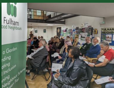
Fulham Good Neighbours AGM